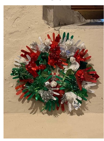
Entry from Tanners Wood Primary School