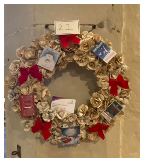
Wreath entry from Abbots Langley Library.

donations were welcome and coffee and mince pies were served throughout the weekend. As people wandered round the church looking at the stunning displays, they were asked to write down their favourite wreath, which turned out to be ... the Abbots Langley Library entry!