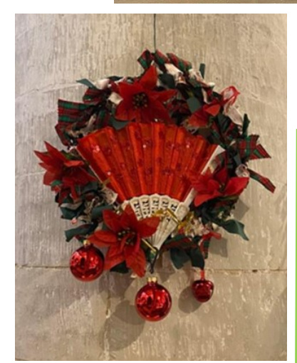
Entry from the Abbots Langley Gilbert and Sullivan Society