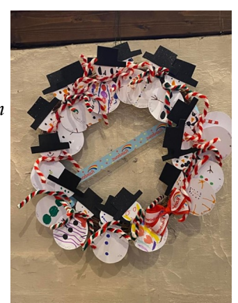
Entry from the Rainbows

Here are some of the wonderful entries at the Christmas Wreath Festival in December. You can read what happened at the festival on page 18.