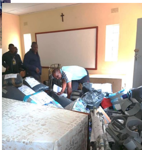
The hospital receives all the items we sent and are starting the task of sorting it.