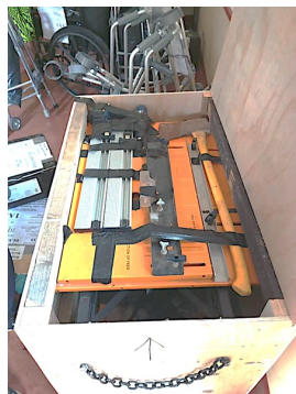
Tools for the hospital maintenance team.