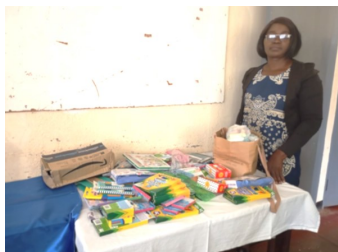
Stationery for the primary schools