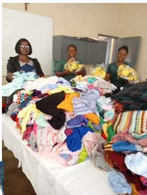
Sorting the knitwear before handing it out to the families.