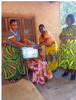
Volunteers on a home visit distributing much needed incontinence pads.