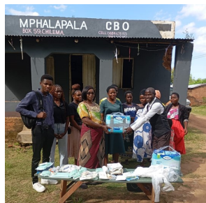
Volunteers at one of the Community Based organisations receiving gifts to be distributed to those in need in the community.