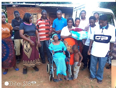
A young disabled woman receives a wheelchair and is able to go out for the first time.